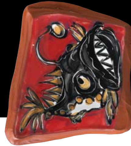
Artist: Karin Kraemer

Potters Council Members, promote your work to the public for FREE in the online Gallery! Visit potterscouncil.org for more details.